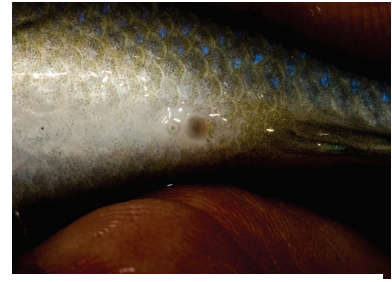
Female vent zoomed in. Note one large vent and one small vent.

Aurora are quite an easy fish to vent when they are above 2", the females vent is easy to see whereas the males is difficult