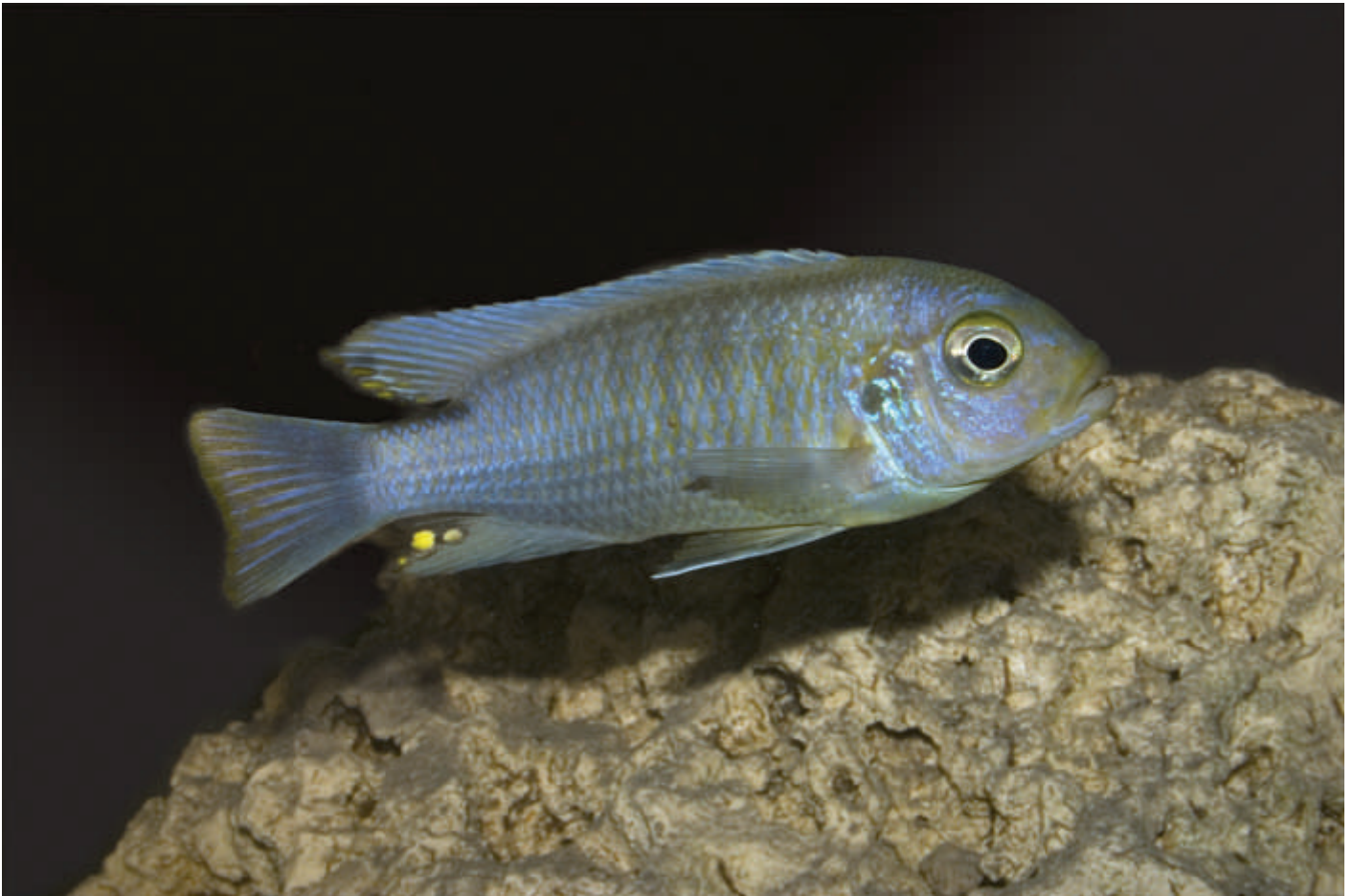
Male Cobwe pronounced cobue not showing his full colours

The Mozambique coast on the east side of the lake is the home to most of the 'Auroa' type species, although there are locations around the lake where these fish have been introduced. They are found in the shallower areas between 2 meters and 10 meters over rocks and the sandy substrate.