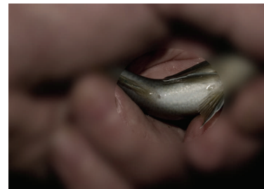
Female vent as you would see it — You can only see the large vent. You would struggle to see a male vent