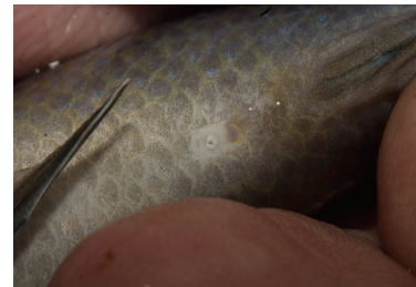
Male vent zoomed in. Both vents are of equal size, also there is a bigger gap between the vents