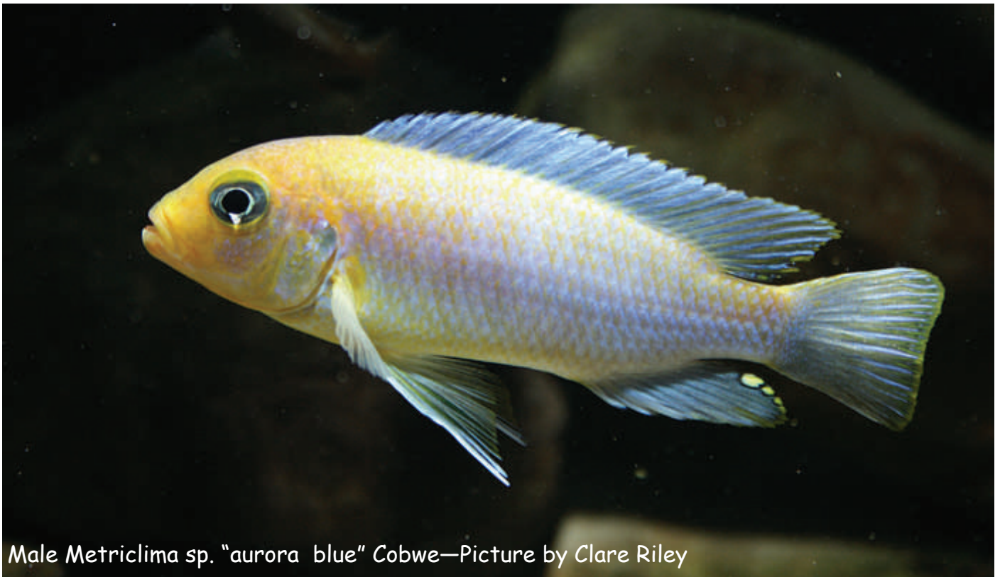
Male Metriclima sp. "aurora blue" Cobwe

The male dorsal fin is blue and does show dorsal spots and occasionally has a yellow fringe. The caudal fin is also fringed by yellow. The yellow on the male covers the whole head area and stretches along the back creating a band under the dorsal fin, this gives it the American common name Pseudotropheus sp. Flameback and in the UK they are also known as Metriclima sp. "hajomaylandi" Cobwe, this name derives from the full yellow face and head. As hajomaylandi are found in much deeper waters I prefer to use the "aurora sp." banner. The female is distinguished by the yellow paired fins and a blue and yellow fringe on the dorsal and yellow fringe on the caudal. The female fins are slightly more rounded and chunky. Egg spots are not a reliable method of sexing as the female usually carries them (see picture). They are quite easy to vent.